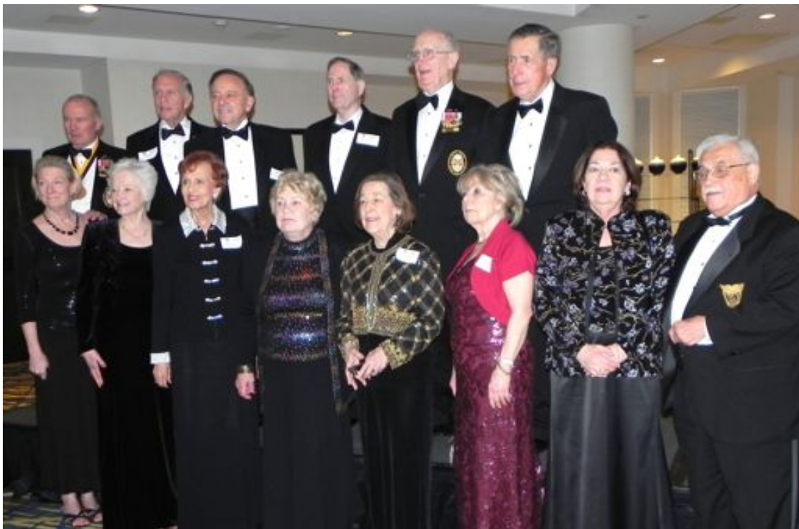
Photo 3 Founder's Day attendees